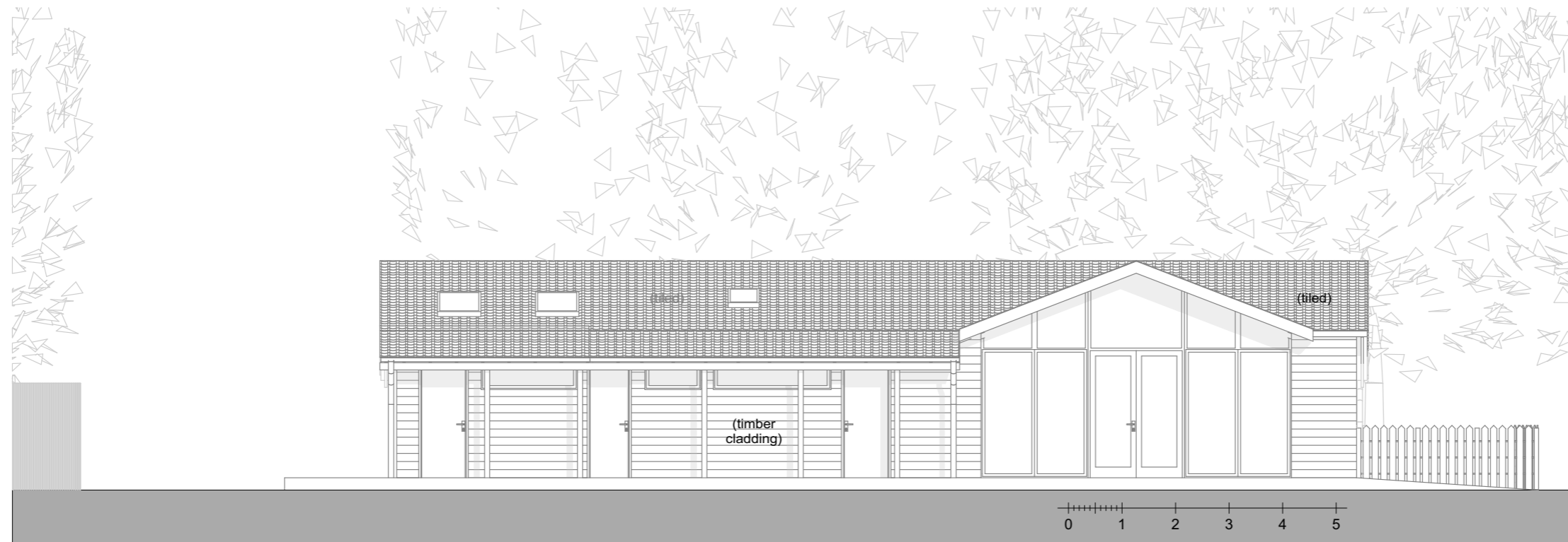
North Elevation - Proposed